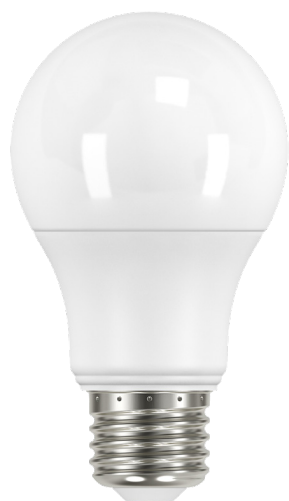
10W A19 E26 Base

Contractor Grade A19 Lamps 60W 6 Packs, Dimmable