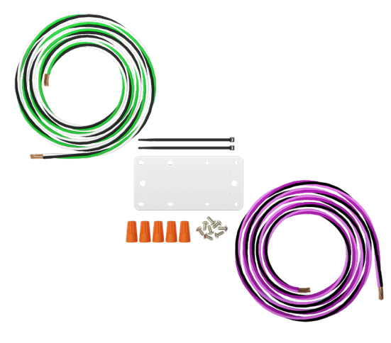
Daisy Chain Mount Kit: SR JOIN KIT

Continuous-run mounting is a breeze with the joiner bracket accessory.