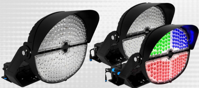
P1-L (850W) and P1-XL (1200W)

Available in 4 lumen packages and 3 NEMA distributions, you can fine-tune your lighting to match any field's needs.