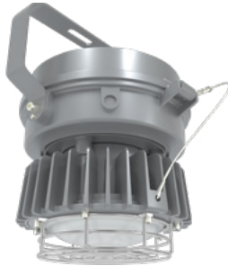
Surface and Pendant Mount*

The HAZLED is available with four mounting options for use throughout an entire site: